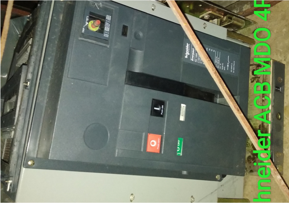
Schneider ACB MDO 4F