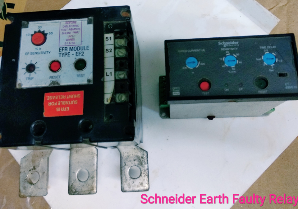
Schneider Earth Faulty Relay