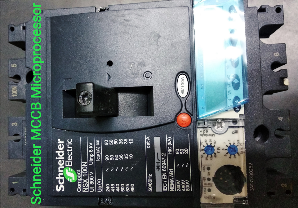
Schneider MCCB Microprocessor